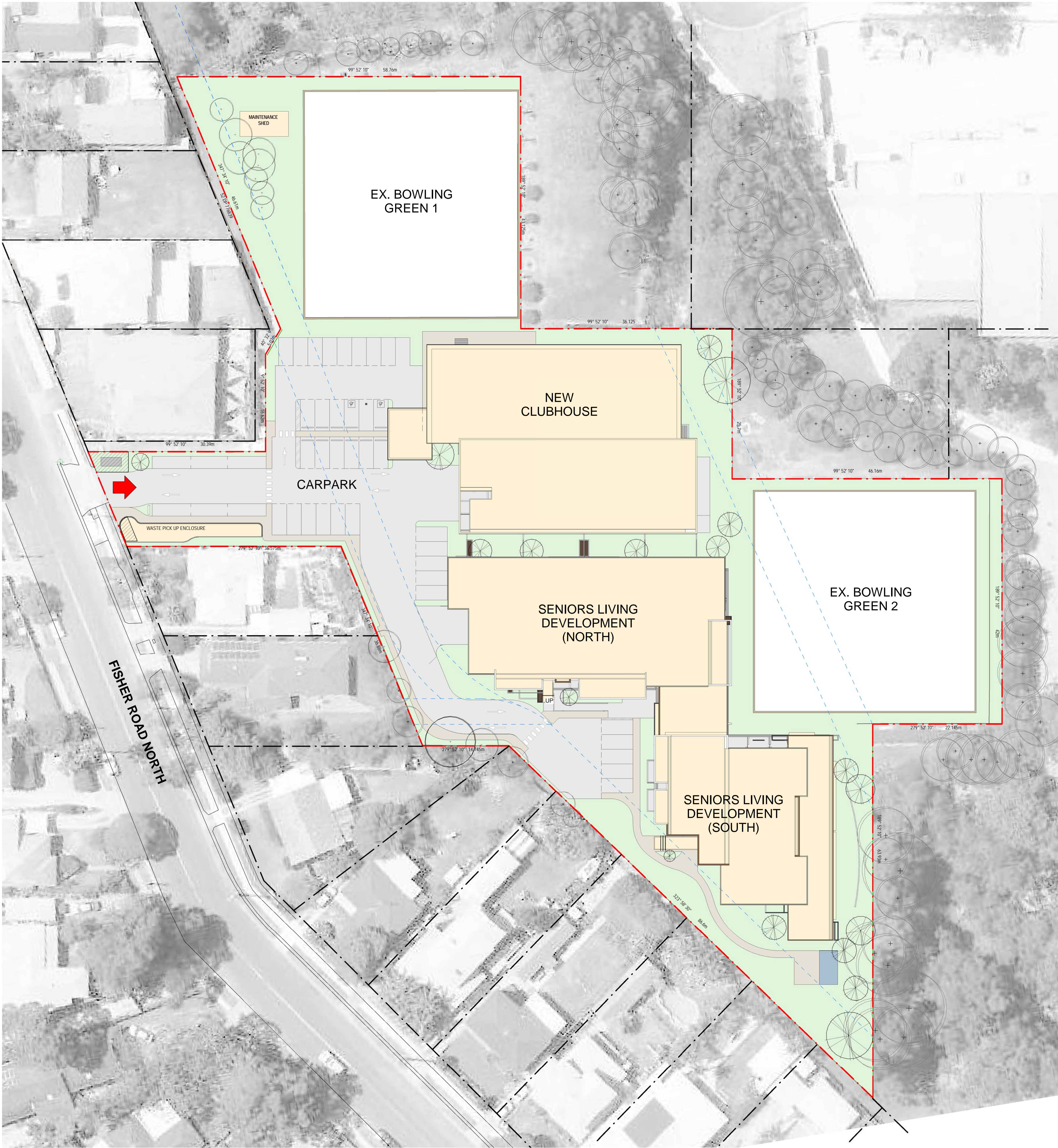
1 OVERALL SITE PLAN SCALE 1: 300

LOCATION PLAN MAP IMAGE